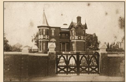
'ROTHA', 29 HARCOURT STREET, HAWTHORN, DESIGNED IN 1887.